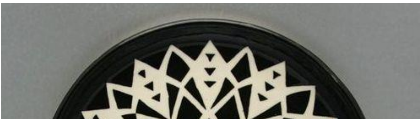
Ceramic artwork by Ada Brzeski

We started with 22 artists and 20 studios in fall of 2019. This grew to 40 artists and 27 studios by February 2021. We are welcoming new artists to the space and also seeing a few departures as artists grow their careers and enroll in MFA programs.