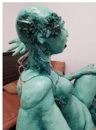
Sculpture by Pansee Atta